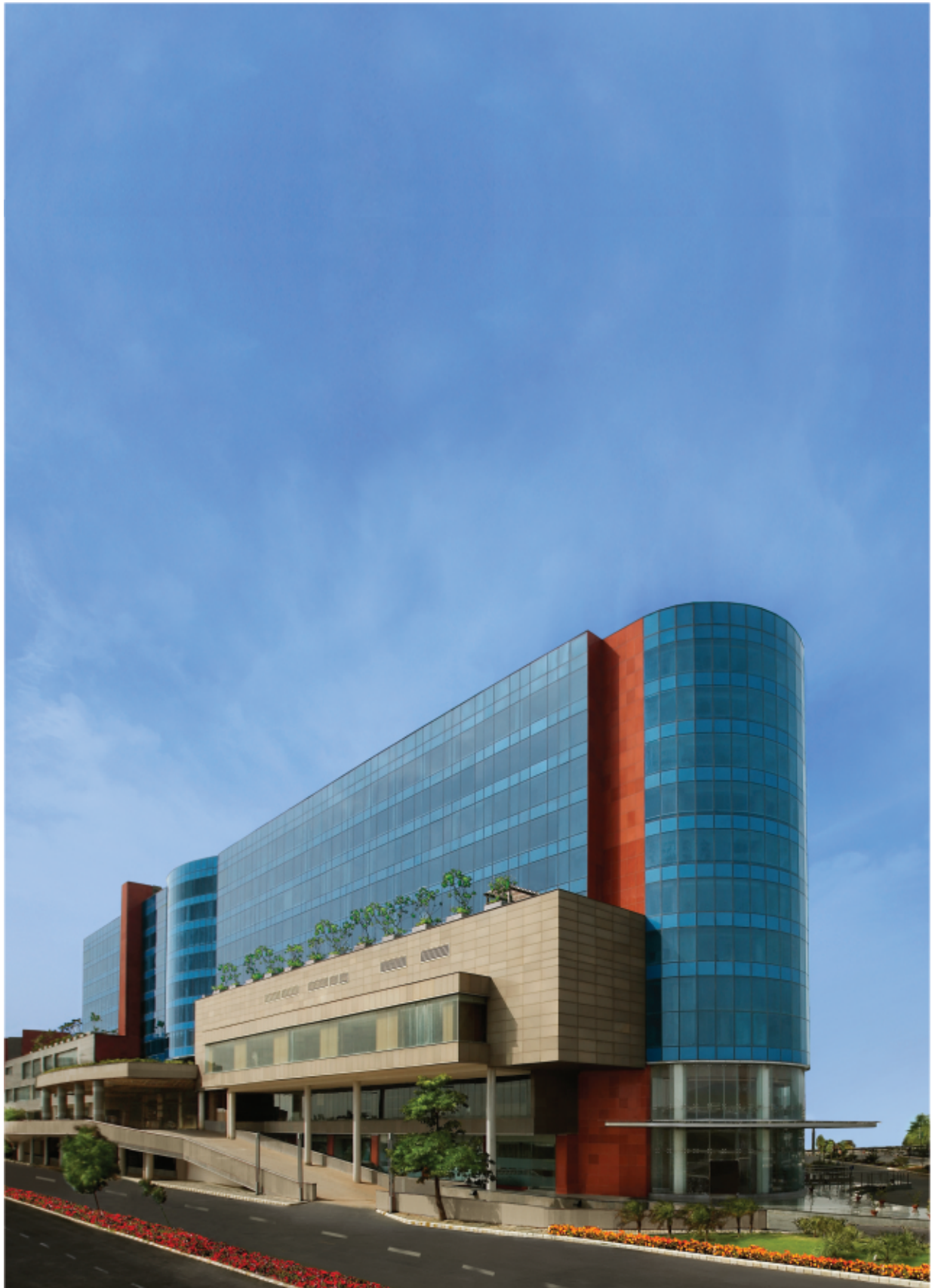
The Leela Ambience Gurgaon Hotel and Residences