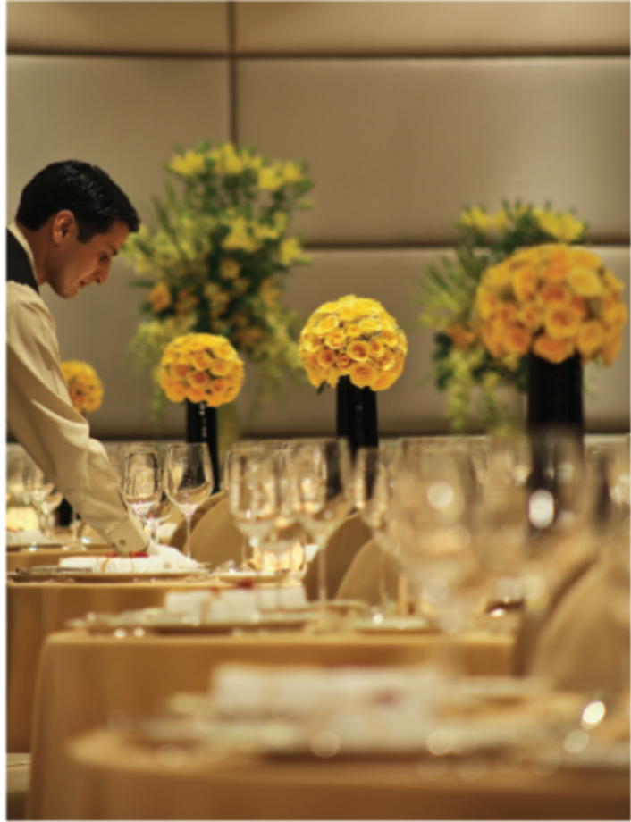
The Royal Room